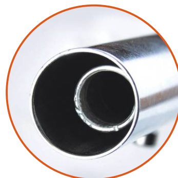
Clever valve adaptor enables screw and nozzle cylinders to be used