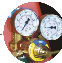
CGA540 inlet connection