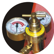
CGA200 inlet connection